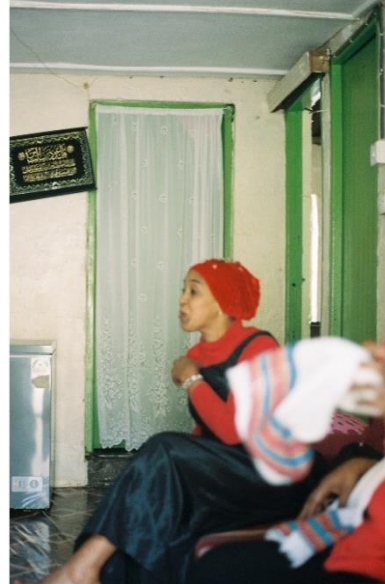
Eid al-Adha. Date: 31 July 2021. Place: Embu, Kenya.